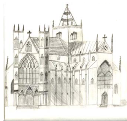
The language of the Church, and therefore of our hearts, is Latin.

Description: This course moves at a standard pace; book is completed in one year. Grading is included. Online access is provided for tests, quizzes, and games for additional review.